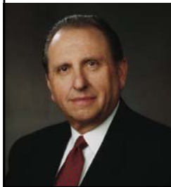
President Thomas S. Monson